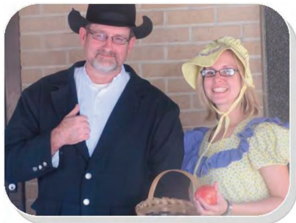
Welcome to Arkansas Southern Region Volunteer Forum.